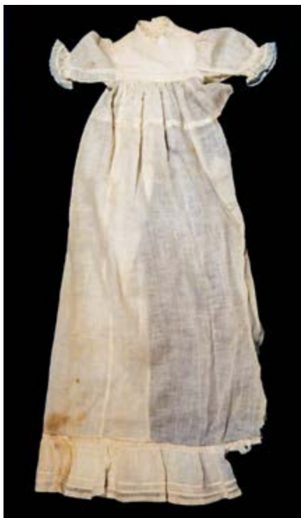
The baptismal gowns of Francisco and Jacinta

Besides prayer for sinners, the one for whom Jacinta prayed and offered sacrifice the most was the Holy Father himself. Certainly, the Great Secret must have impressed Jacinta in a very special way: not only the vision of hell, but also the second and the third part of the secret, especially in what concerned the Pope.